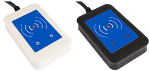
Desktop version (inlay customizable)

Elatec's TWN4 family of transponder readers and writers allows users to read and write to almost any 125 kHz, 134.2 kHz and 13.56 MHz tags and/or labels – it supports all major transponders from various suppliers like ATMEL, EM, ST, NXP, TI, HID, LEGIC, etc. and ISO standards like ISO14443A/B (T=CL), ISO15693, ISO18092 / ECMA-340 (NFC).